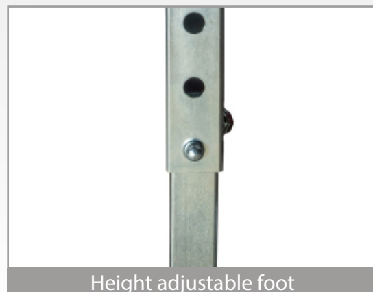
Height adjustable foot